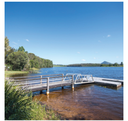
Mary River Cod Park.