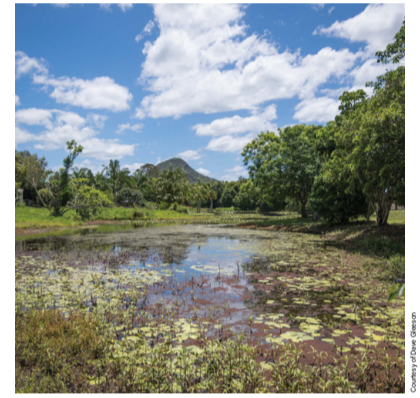
Woondum Trail - Tablelands Road at Cooran looking west.